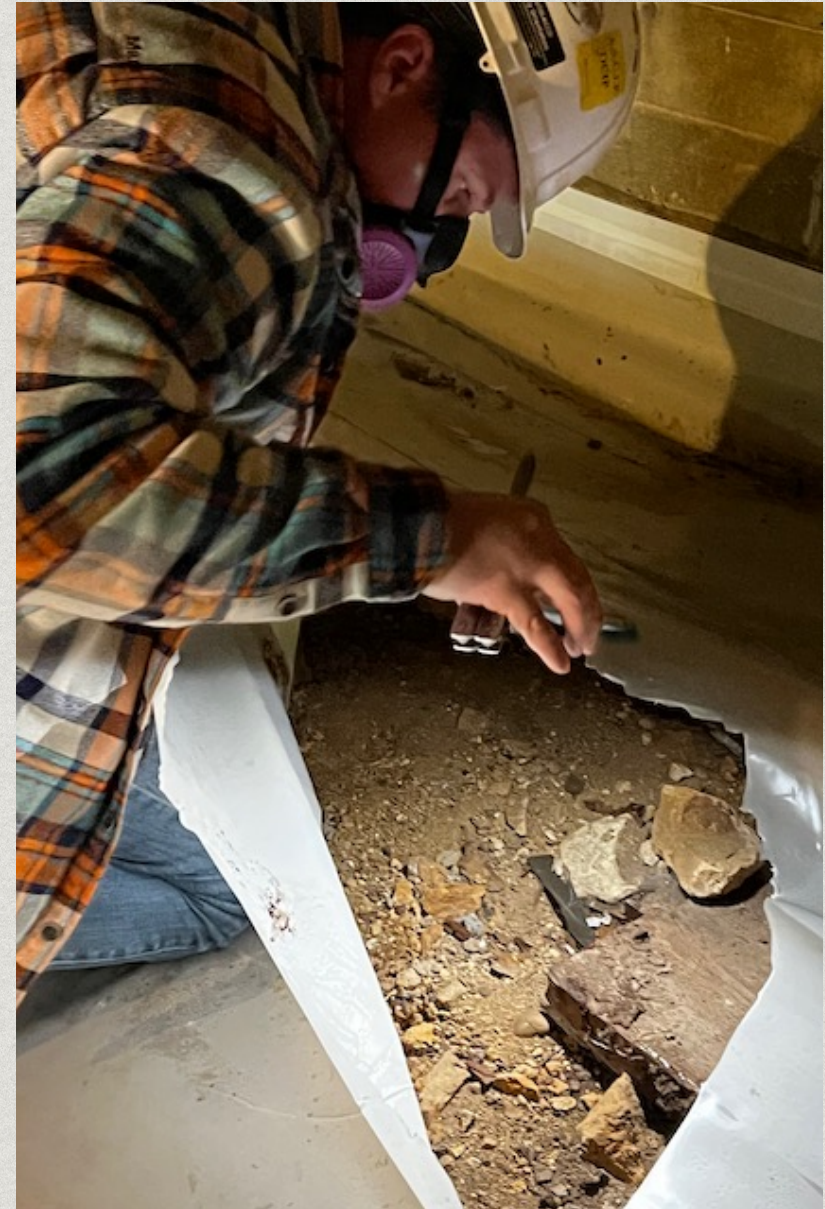
ELLIS ENVIRONMENTAL MANAGEMENT