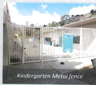
Kindergarten Metal fence