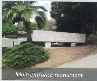
Main entrance monument