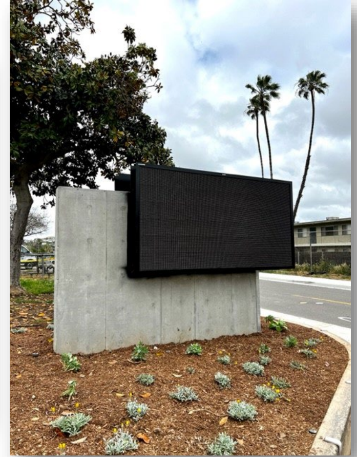
Access Improvements, New Marquee, Landscaping