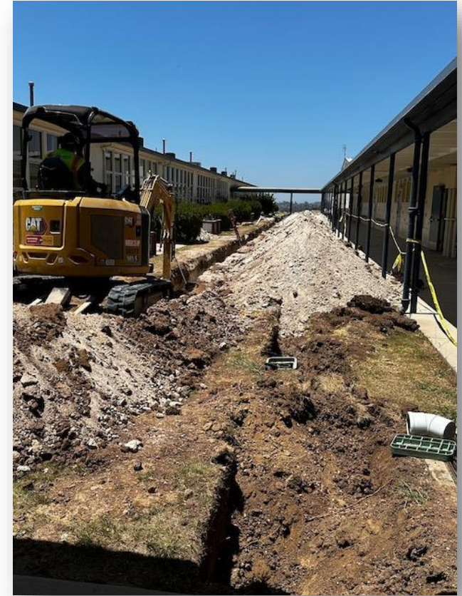
Underground Infrastructure Summer Work