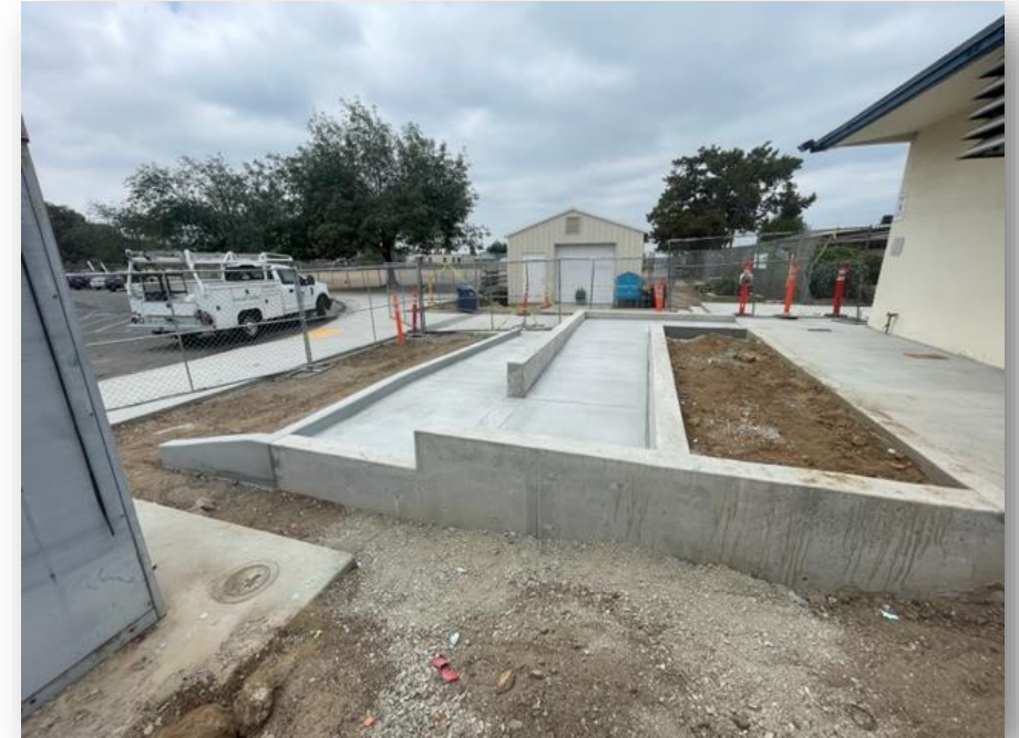
Underground Infrastructure Summer Work and New Entrances