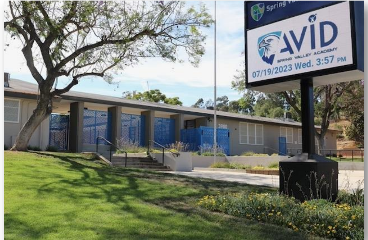
Spring Valley Academy