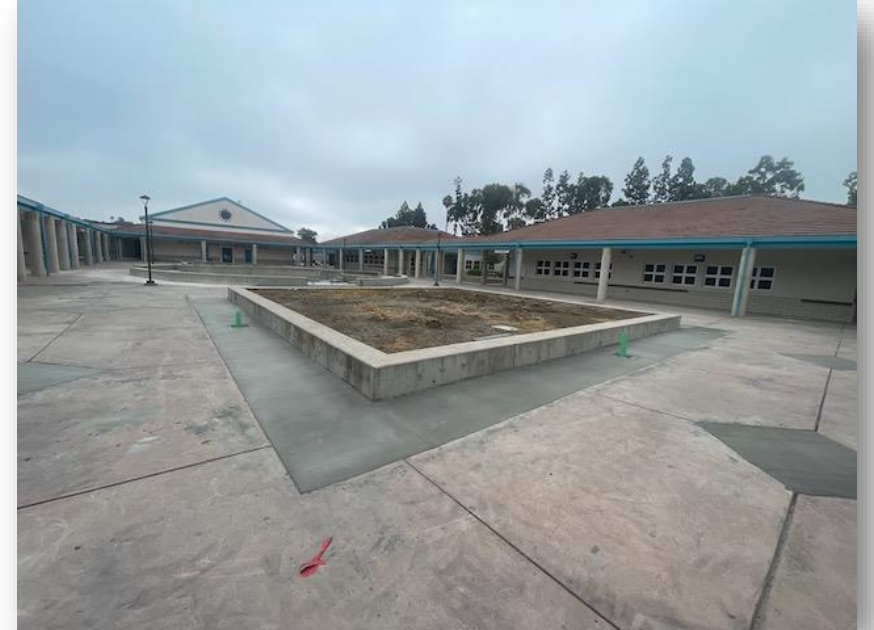
Underground Infrastructure Work, Palm Tree Removal, ADA Parking Improvements