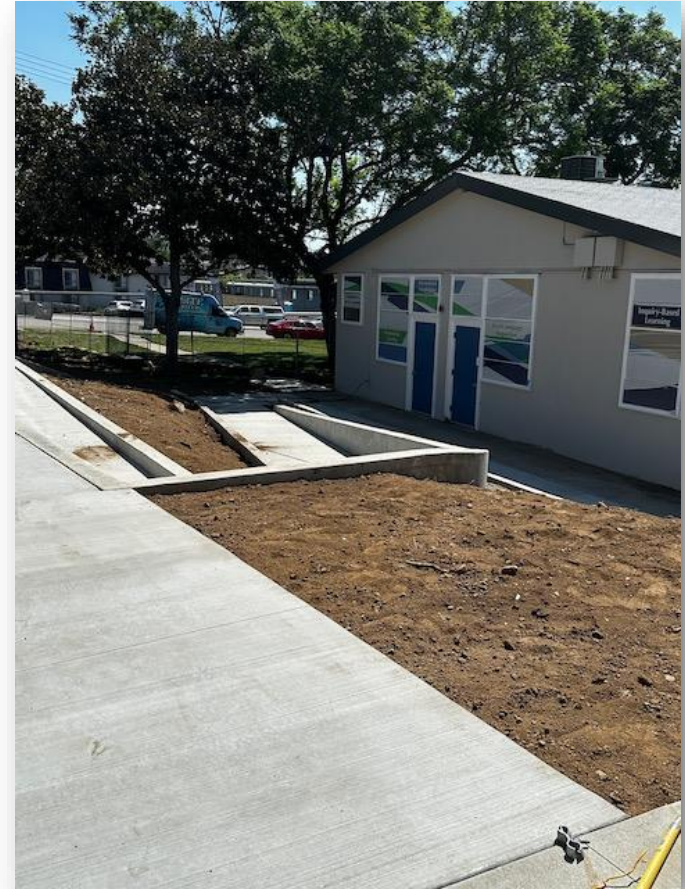
New Access Ramp and Bus Drop-off