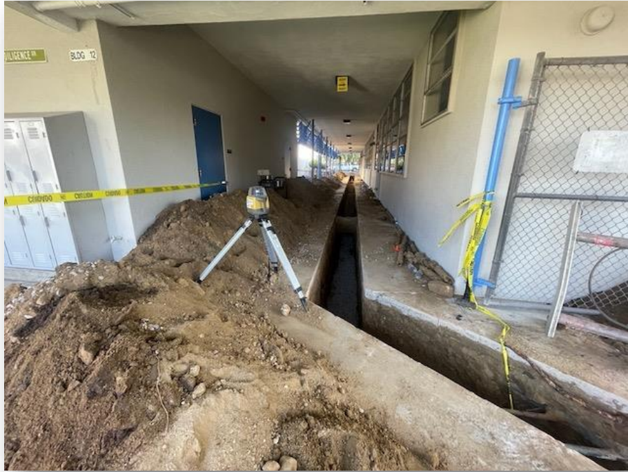
Underground Infrastructure Work